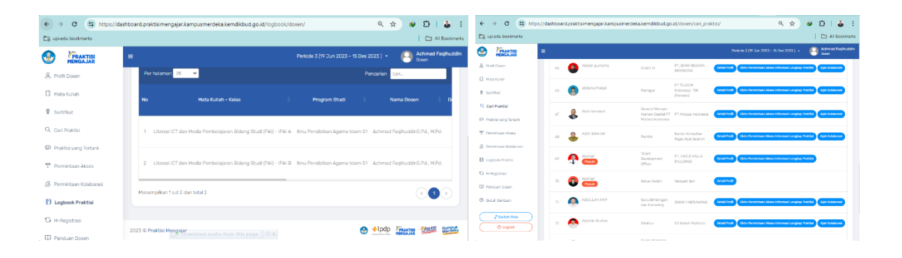
Figure 2. Teaching Practitioner Platform to register collaborative class plans with practitioners.

Finally, a program report and evaluation are carried out to evaluate the effectiveness and impact of collaboration between practitioners and universities in improving the quality of learning. Collaborative learning is a pedagogical approach where collaboration occurs to achieve common academic goals. Activities carried out include learning together, engaging in discussions, problem solving, and collective knowledge construction (McDuff 2012). Collaborative learning has been shown to increase meaningful learning by encouraging deeper conceptual understanding through shared knowledge construction (Farrokhnia et al. 2019).