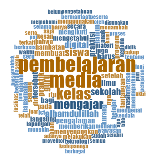
Figure 1. NVivo 12 Word Cloud display from the results of the Word Frequency Query of interview transcript data and survey results.