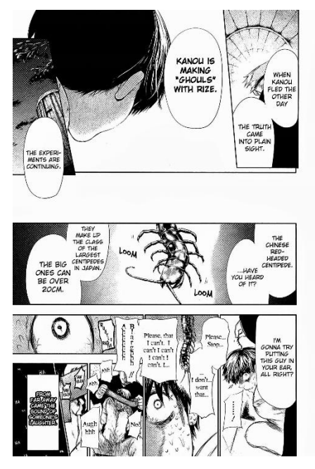
Figure 16. Yamori putting a centipede in Kaneki's ear; one of the feasible torture methods Kaneki experienced

who to live among his friends; a mother, or her son. Naturally, Kaneki begged to save them both, but Yamori proceeded to kill the son first, then kill the mother in front of Kaneki's eyes. All of which seem to be possible and not extravagant. Unlike the torture rack or dungeon chains often depicted in several horror stories, which seem unlikely to exist in the minds of an ordinary human's daily lives.