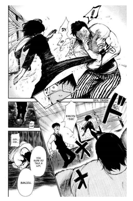
Figure 4. Crossing the Threshold I

Act I serves as an introduction of the two worlds in the story. With Kaneki portrayed living normally in his