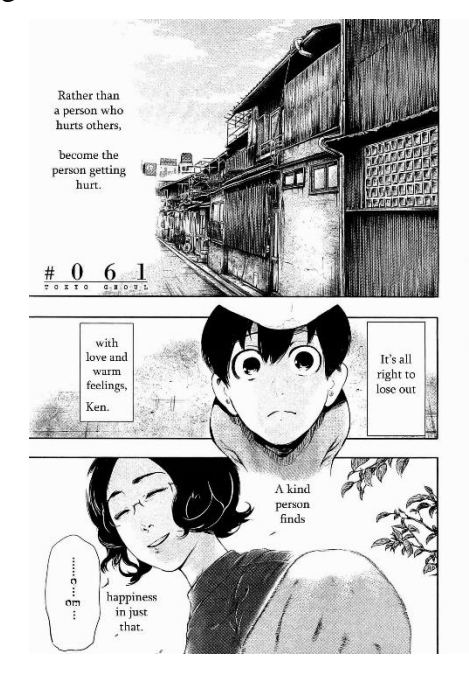
Figure 15. Kaneki being taught his life principle by his mother since childhood