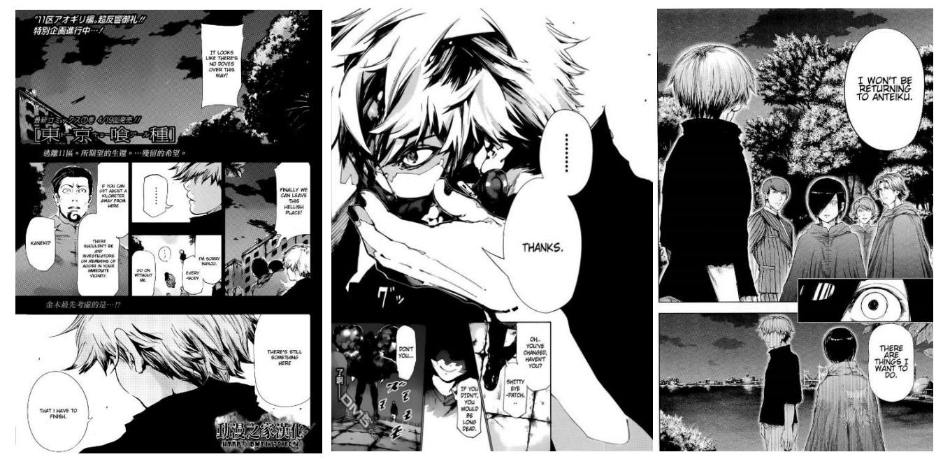
Figure 12. The Road Back

employees' presence, Kaneki goes to save them. This is the event where Kaneki is shown to begin his journey back to the ordinary world by trying to