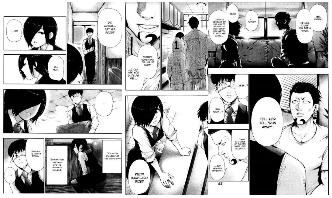
Figure 1. The Ordinary World