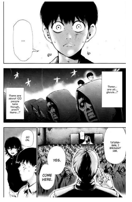
Figure 5. Crossing the Threshold

world, the ordinary world is introduced as the human world that rarely faces major conflict. It is the place where