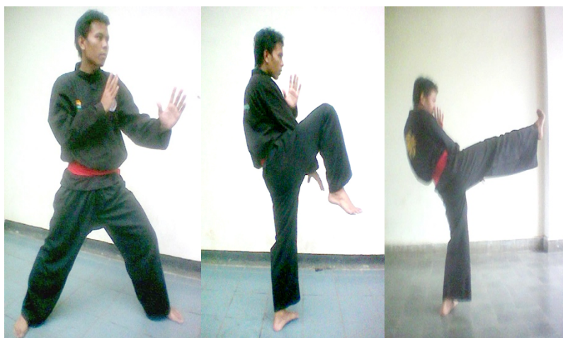
Figure 1. Sequence Of Straight Kick Movements (I,II,III)

Lubis (2004: 26) states about straight kicks as follows: "An attack that uses one foot and leg, the trajectory is forward with the body position facing forward, with impact on the base of the inner toes, targeting the heart and chin." The straight kick sequence begins with sikap pasang (I), a flexion movement in the groin joint (coxae articulation) (II) then extension (straightening) in the knee joint (genue articulation) (III). More clearly regarding the straight kick movement can be seen in Figure 1 below.