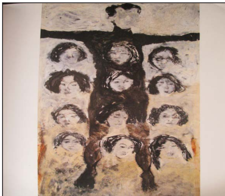
Picture 2: “In Between” (200 x 100 cm), Mixed Media on Canvas, by Putu Sutawijaya, in 2000b

“In-Between” painting, according to Putu Sutawijaya, is a phenomenon that dark skin color (black) does not become a barrier