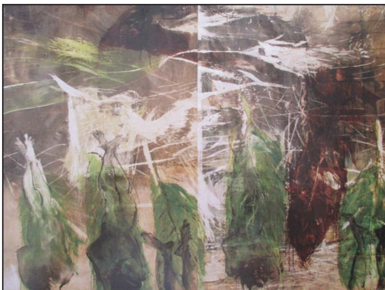
Picture 1: "Fire Sleep for a Moment" (140 x 250 cm – 2 panel), Mixed Media on Canvas, by Putu Sutawijaya, in 1998b

The painting on "Fire Sleep for a Moment" has a narrative that pushing all elements of the nation to encourage taking