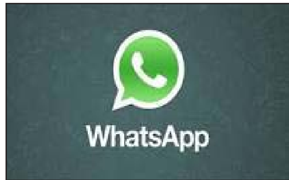
Figure 1: WhatsApp Icon

and knowledge be provided and elaborated in some websites, such as at web.2.0, website of http://learnenglishbritishcouncil.org/en/apps (10/7/2019), and some others interesting and insightful webs, which will be helpful for beginners and other levels learners to learn English at anytime and anywhere, formal and informal situation (Motteram, 2013; Pim, 2013; and Akhmad & Amiri, 2018). All the vary and essential information preceding can be accessed through WhatsApp mobile learning as the right forum for discussing and sharing for learners and teachers. See figure 1.