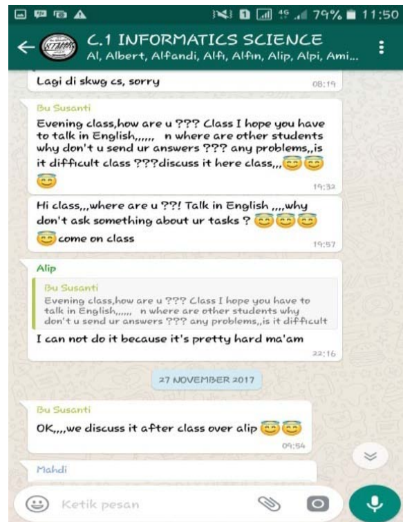
Figure 2: WhatsApp Platform

Next, 24% of the students disagree with WhatsApp applied as the assisted learning tool in teaching and learning English. Of course, there are some reasons followed, such as: "They didn't understand what the passage was, but shamed to ask to their friends or their lecturer"; "They were passive students, lazy, afraid to make mistakes"; and even "They are not ready with the technological advanced applied in education, such as the use of