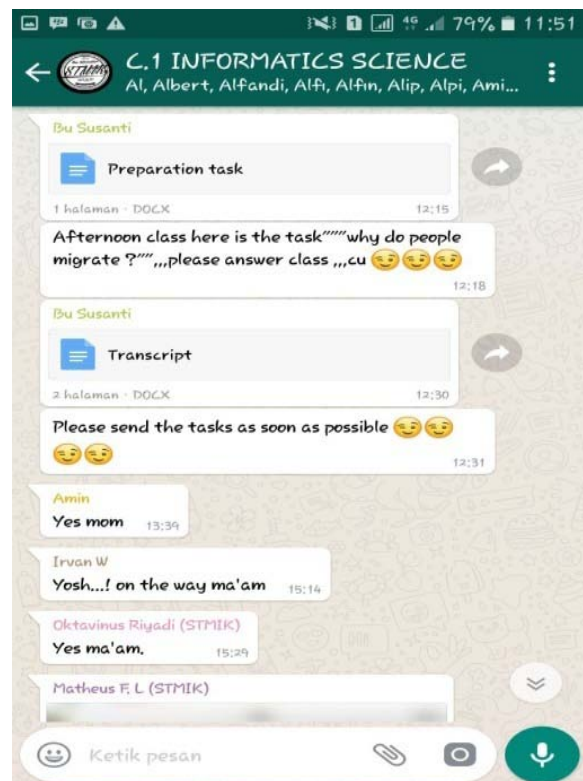
Figure 3: WhatsApp Platform