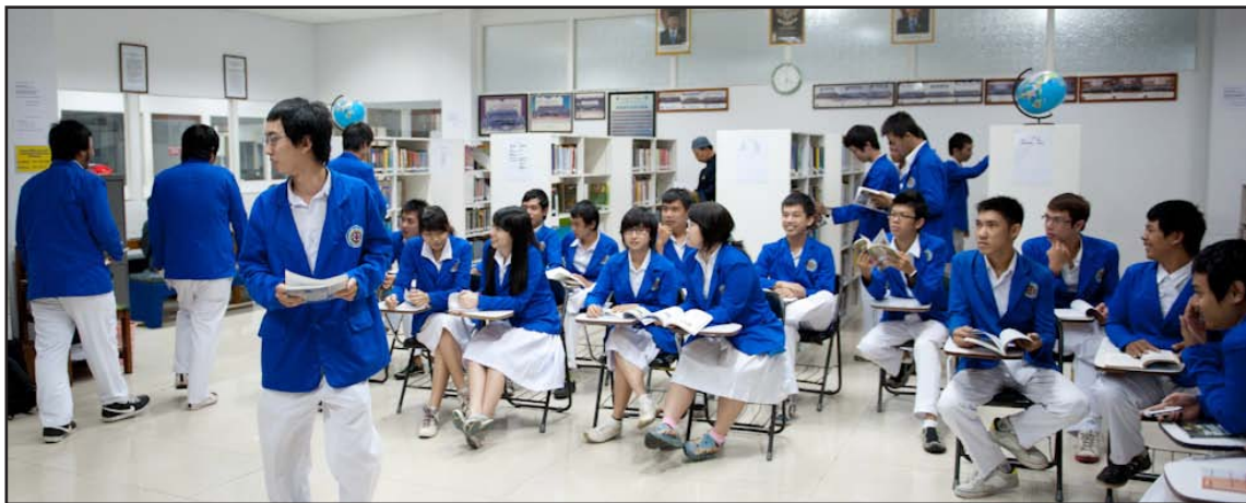
Students of STMIK Pontianak, West Kalimantan, Indonesia