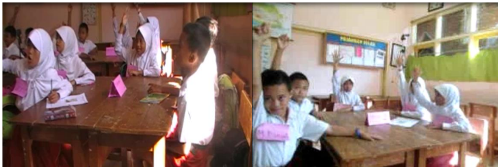
Figure 2. Scenes of Learning Video Snippets from Attitude 2.a (Curiosity Attitude with the Indicator of Answering Teacher Questions Enthusiastically).

order to overcome this problem, the description of the rubric was changed to be more about the initiative or encouragement (own initiative, encouraged by the teacher, encouraged by other students, or not answering questions).