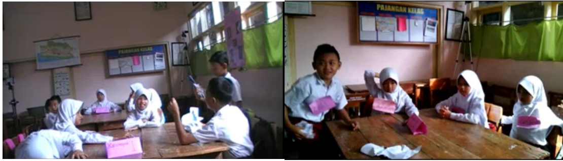
Figure 1. Scene of Learning Video Snippets from the Attitude of 1.a (Caring for the Environment Attitude).

After obtaining the video on the learning process, the video was processed by selecting scenes related aspects and indicators of the scientific attitude being tested.