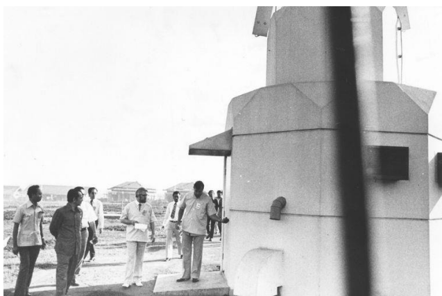
Figure 2 Experts from Hughes who observed the launch of the Palapa satellite in Cibinong

Syaharuddin and Susanto (2019) summarized the change during the post-reformation period. President B. J. Habibie started to lead in 1999; he freed tuition fees for elementary to high school. Meanwhile, the rules that hinder students' creativity and freedom regarding the normalization of campus life are repealed. In addition, scientific institutions, such as university campuses, are freed from outside intervention and influence. Then, the government of President Abdurrahman Wahid (Gus Dur) issued a law on the balance of central and provincial finances (decentralization). With this law, education is in the regions' hands as policy executors at the local level. The government launched school Operational assistance funds based on the calculation of the cost of each student unit. Gus Dur's government was notorious for significantly increasing teachers' salaries. Megawati's government