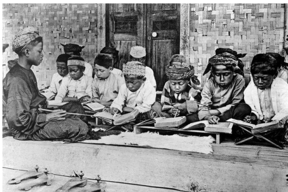
Figure 1 Students studying at Pesantren on Java Island

In the thirteenth century, Islamic traders began to influence the color of education in Indonesia until Islam became a religion that dominated the Indonesian archipelago. Islam developed a mass education system, namely pesantren (see Figure 1), emphasizing the doctrine of Islam and the Islamic way of life (Hicks & Peacock, 1973). The influence of Christianity entered the Maluku region in the sixteenth century. The Christian religion strengthens the local population's literacy by teaching mathematics, science, reading, and writing (Bjork, 2005).