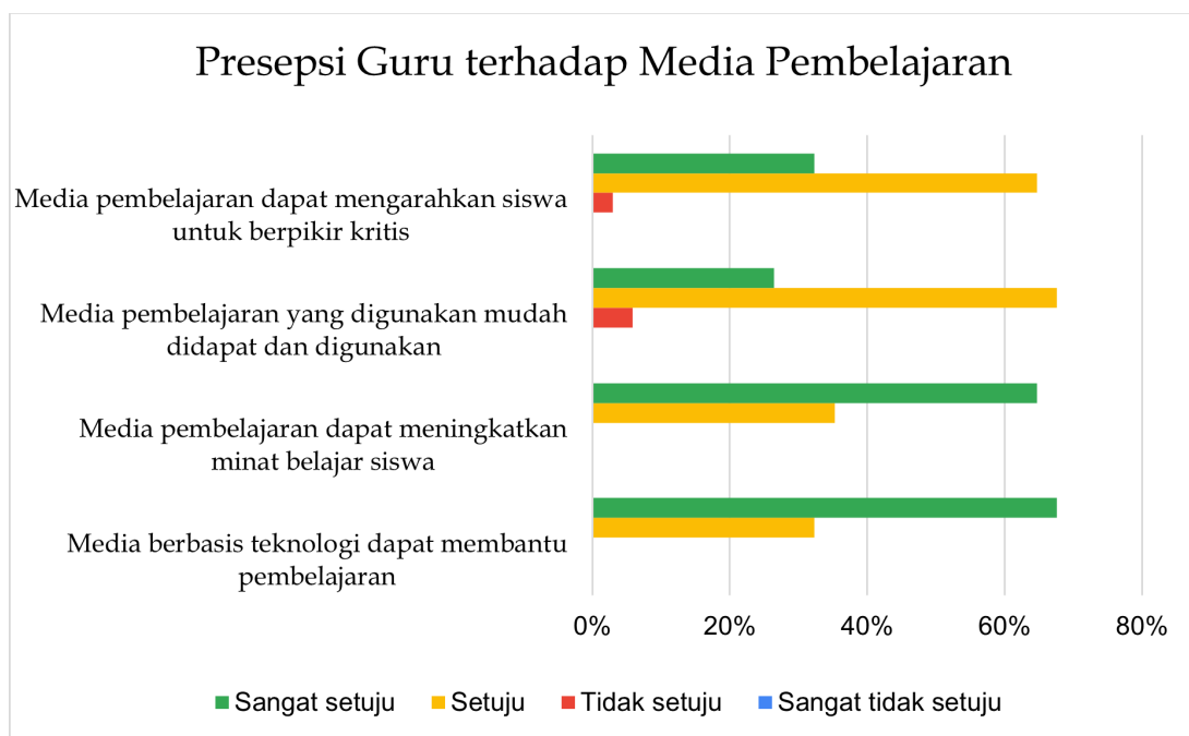
Figure 3. Results of Teacher Perception Questionnaires Regarding Learning Media

The following discussion will be divided into four parts. First, namely, about geography learning strategies running in schools. Geography teachers in Langkat Regency are very good at implementing learning strategies. This is proven by the fact that as many as 77% of geography teachers in Langkat Regency have abandoned the lecture method in learning. Apart from that, teachers have used media in the learning process.