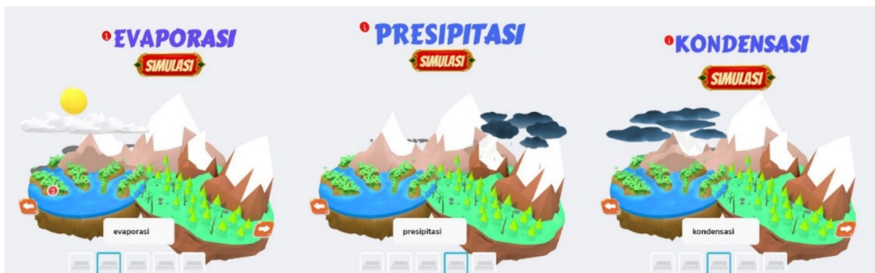
Figure 5. AR Examples for Learning on Assemblr Edu

From the various reviews regarding teacher perceptions above, there is a problem that not all teachers can use and utilize AR in hydrosphere material to improve students' critical thinking skills. The most influencing factor is that not all Langkat Regency high schools have