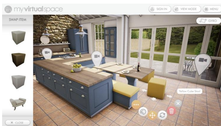
Figure 4 My Virtual Space

With the advancement of technology in recent years, new forms of teaching have emerged. In the world of education, Virtual Space technology has been widely used for its benefits to support more effective education and assist academics in finding new learning methods, one of which is the creation of Virtual Space-based learning modules. In Virtual space in education, there are various potentials and advantages of applying Virtual space technology for education, among others, one of which is having the power to attract students in ways that were previously not possible and provide freedom for students to carry out the discovery process in their own way. VICE-Tel is an innovative tourism accommodation learning platform that can be measured with the industry standard SNI ISO 21001:2018, Management System because it can improve the quality of education.