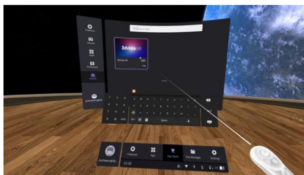
Figure 3 3DVista