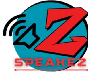
Figure 1. Speakezio application icon and image of the application's initial display

Based on the mapping results, it was then determined that the type of AAC used in this development was a high-tech AAC aided system, namely supported by high-tech software and hardware devices, namely applications and smartphones. The Speakezio (speak electronic zio) application developed is a AAC system that contains communication symbol icons in the form of images which are a form of visualization of everyday nouns and verbs.