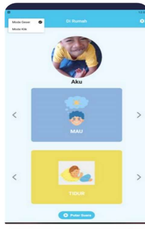
Figure 2. Sliding mode display

This application provides 2 operating modes, namely sliding mode and click mode. Users can choose the mode according to comfort when using the application. In sliding mode, users can slide the image icon until they find the desired image. In this mode, users can only express one expression with a simple sentence structure, such as "I want to eat", "I'm sleeping", and so on. This mode is also suitable for users who have low expressive or receptive language skills because in this mode users are presented with structured sentences, so they only need to move the icon according to the word in question.