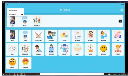
Figure 3. Click mode display.

The Speakezio application also has several features that can be used in the application, namely the Let's talk, Topics, Conversation recording, Settings, Send and Progress features.