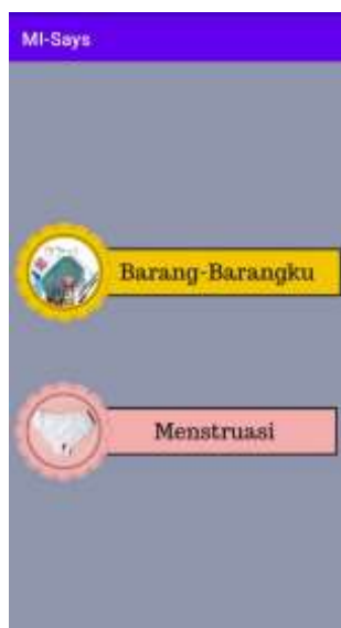
Figure 3. Content of alternative and augmentative communication system “Mi-Says”

My stuff content consists of items that are often used in the learning process including bags, shoes, pencils, pens, books, colored pencils, rulers, erasers, x-type, scout uniforms, sports uniforms, rice boxes, water bottles, watches, and glasses. Menstrual content consists of items that are commonly used during menstruation including sanitary pads, underwear, plastic, and trash cans. Menstruation content also contains pictures as a reminder that while menstruating it is forbidden to pray. Menstrual content is equipped with video tutorials for putting on sanitary napkins, removing sanitary napkins, washing sanitary napkins, inserting sanitary napkins into plastic, and disposing of sanitary napkins.