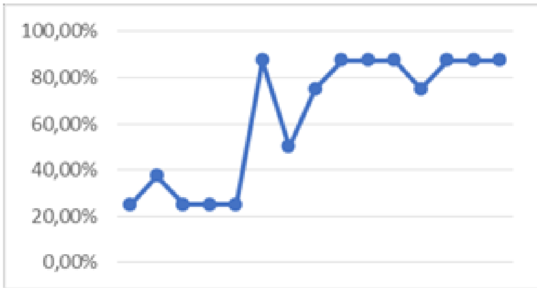
Gambar 1. Intervention results.

The results obtained in the baseline and intervention phases are: