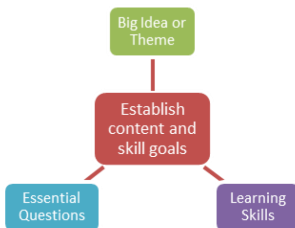
Figure 1: Elements of Establish Content and Skill Goals

Projects should be directed toward essential ideas or themes in the curriculum that are rigorous enough to support in-depth study and student construction of meaning. Final collection is one of course in fashion design education. In Indonesia, this course is for final-year students. The content and skill goals of this final collection course are student can develop a collection, manage event organizer, and show their collection. The big idea or theme is developing collection and showing to the public. And the question is how to create the best collection and how to make succeed this big event.