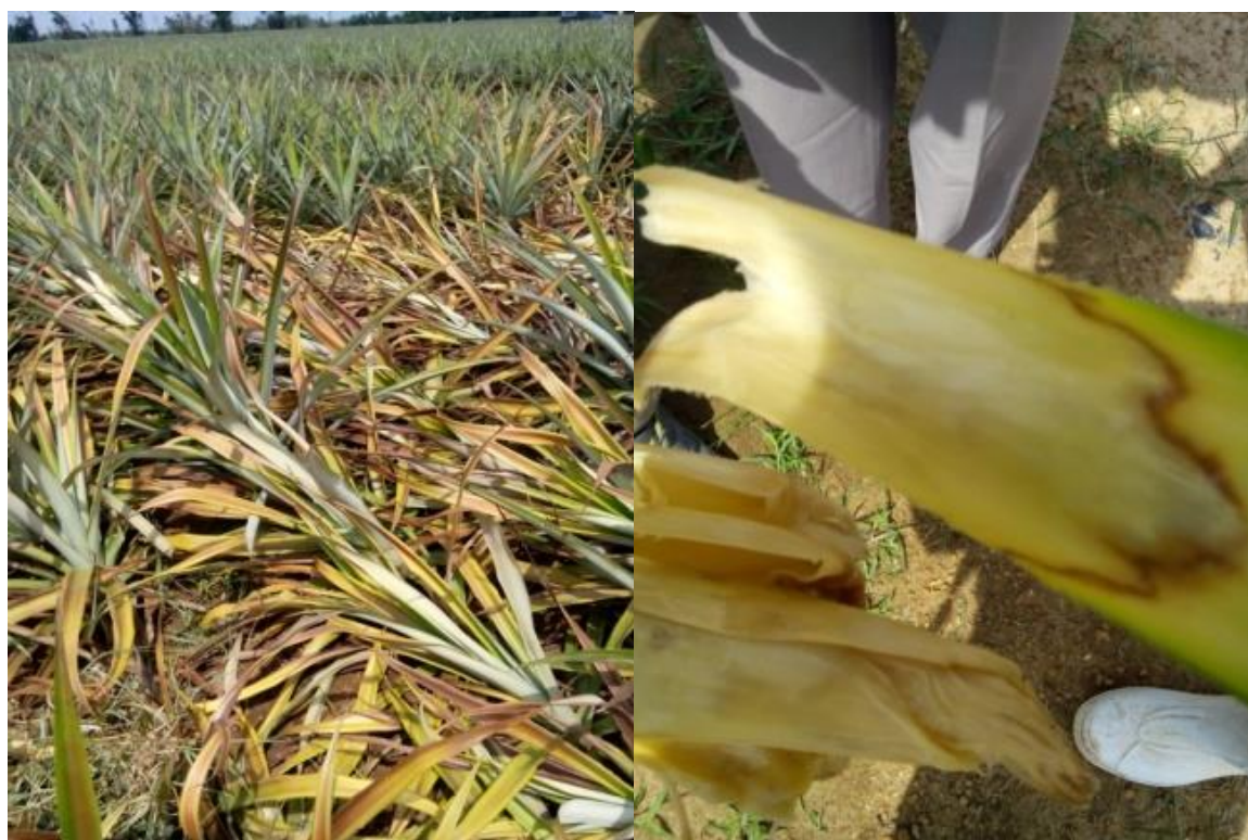
Figure 1. Symptom of heart rot disease caused by Phytophthora sp. in pineapple plantation in Indonesia. Figure in the left is the low magnification of picture, whereas figure in the right is the high magnification.

when a load (or stress, pressure) is applied to a soil (Allmaras et al. , 1988; Fox & Kamprath, 1970). The first impact of compaction is the loss of pore space between aggregates (interaggregate pore space) as the soil volume decreased. The loss of interaggregate pore space has a major effect on water infiltration and drainage, gas exchange and aeration (oxygen diffusion), mechanical resistance to root penetration and proliferation, heat movement, and biological activity of both soilborne pathogens and the host organism (Allmaras et al. , 1988)