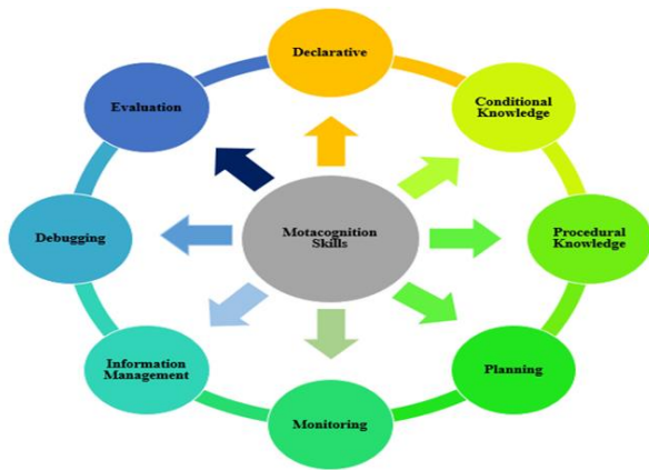
Figure 2. Metacognitive Skills Magno (2010, p. 142)

The present research will draw upon these theories to seek out the relationships between learning style and metacognitive skills and critical thinking.