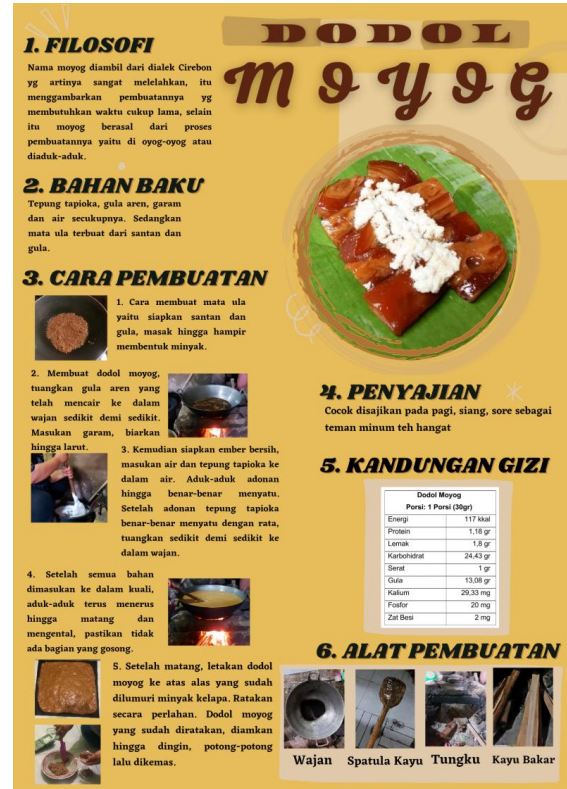
Figure 8. Infographics of Dodol Moyog