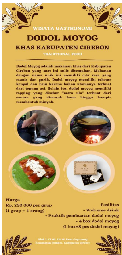
Figure 7. Gastronomy Travel Brochure for Dodol Moyog

Gastronomy Travel Brochure for Dodol Moyog.