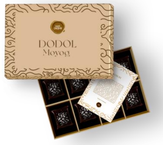
Figure 6. Kraft Carton Packaging

The following is the recommended packaging for dodol moyog manufacturers, the packaging is made of kraft carton with a size of 24cm x 8cm x 12cm. The kraft carton and clear wrapping materials for dodol moyog were chosen because dodol moyog is a food that is heavily coated with coconut oil, so using the thick packaging is considered safer and more practical for long trips. In addition, packaging made of kraft cardboard has the advantage of being environmentally friendly and recyclable.