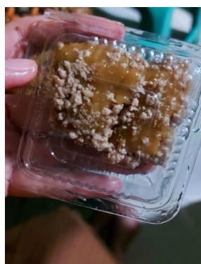
Figure 5. Presentation of Dodol Moyog Using Plastic

However, along with the times, now dodol moyog is served using plastic and then stamped so that it can be closed. This method is considered practical and is done so that the mata ula is visible and dodol moyog look more beautiful.