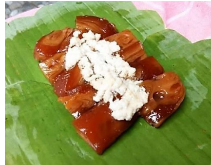
Figure 4. Dodol Moyog

mata ula or blondo topping. This snack has a sweet taste combined with savory from the mata ula. The texture and shape of the typical dodol moyog is still the same from ancient times until now because it is passed down from generation to generation and maintains its original shape.