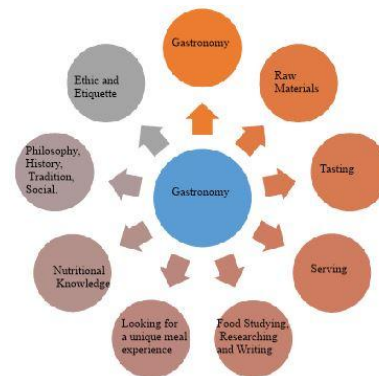
Figure 2. Gastronomic Components

Gastronomy itself presents a different way of serving and enjoying food or drink that makes it appear that there are unique things contained in a food or drink in a tourist destination, giving rise to a new experience for tourists who do it.