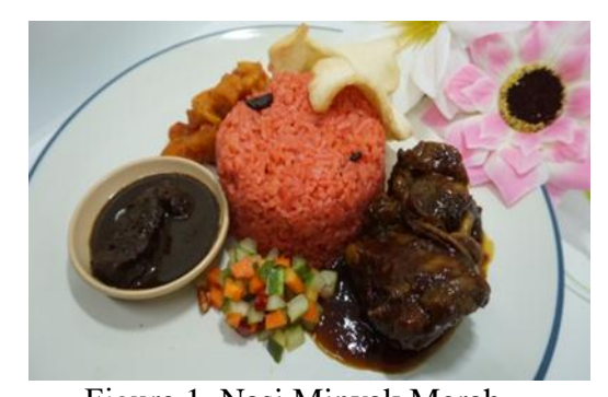
Figure 1. Nasi Minyak Merah

Figure 1 is an example of a nasi minyak merah supplemented with side dishes namely malbi meat, soy sauce chicken, potato sambel, pickles, and crackers. This food can be found in Dapur Ombai which sells typical Middle Eastern food.