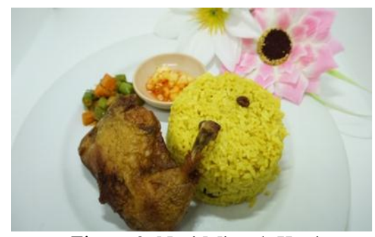
Figure 2. Nasi Minyak Kuning

Figure 1 is an example of a nasi minyak merah supplemented with side dishes namely malbi meat, soy sauce chicken, potato sambel, pickles, and crackers. This food can be found in Dapur Ombai which sells typical Middle Eastern food.