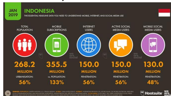
Figure 3. Data on Indonesian Internet Users surveyed by Hootsuite.

Opinions about local content also come from (initial) D who works as a hair cutter. He often go there because the facilities were complete and the infrastructure was good, so when he wanted