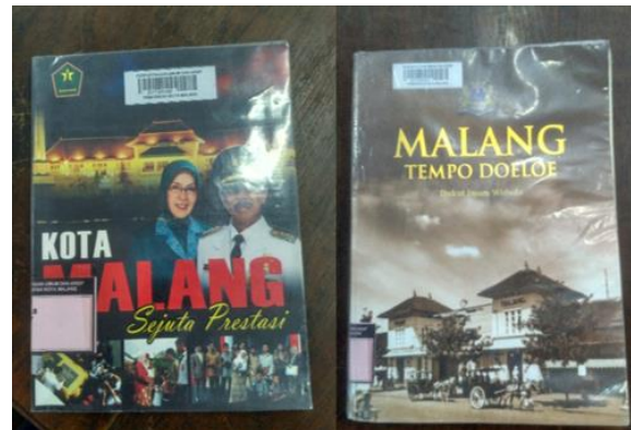
Figure 2. Some local content located in Malang entitled Malang Sejuta Prestasi and Malang Tempo Doeloe

Malang Public Library, because the participants must write about Malang.