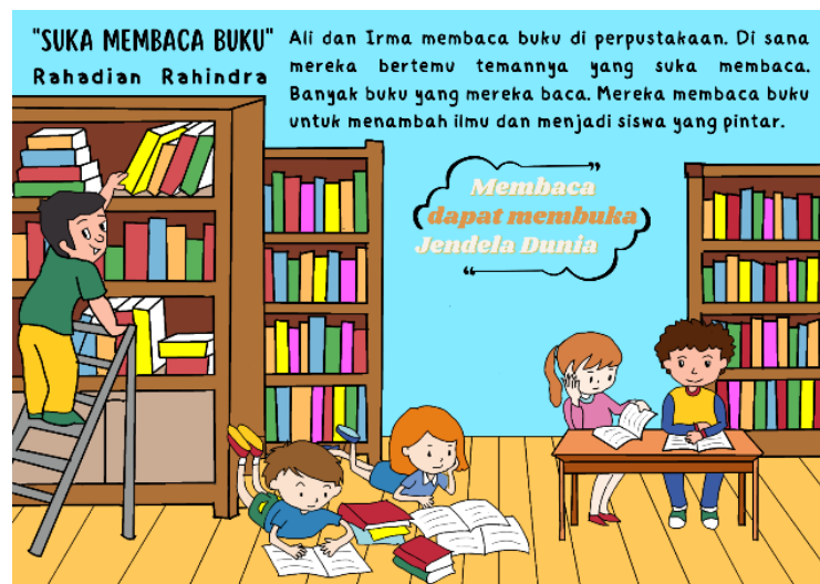
Picture 2. Theme 2: My favorite Subtheme 4: Loves Reading