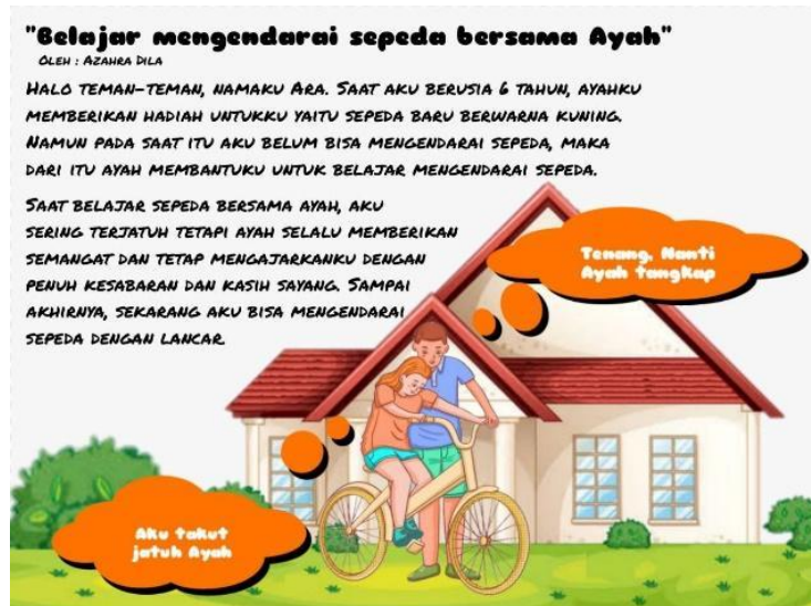
Picture 1. Theme 1: Myself Subtheme 3: I Take Care of My Body