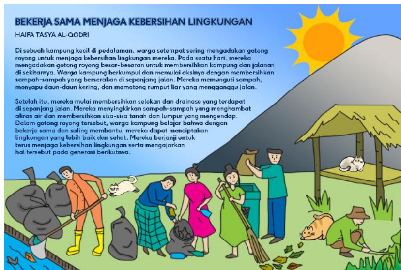
Picture 6. Theme 6: Clean, Healthy and Beautiful Environment Subtheme 4: Working together to maintain cleanliness and Environmental Health