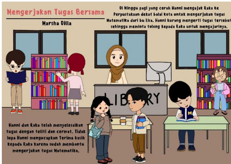
Picture 3. Theme 3: My Activities Subtheme 1: Morning Activities