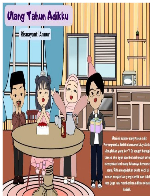
Picture 4. Theme 4: My Family Subtheme 1: My Family Members