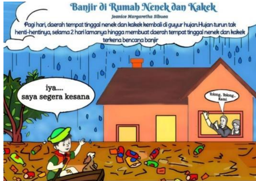
Picture 8. Theme 8: Natural Events Subtheme 1: Natural Disasters Source: Jeanice Margaretha S. (PGSD Student)