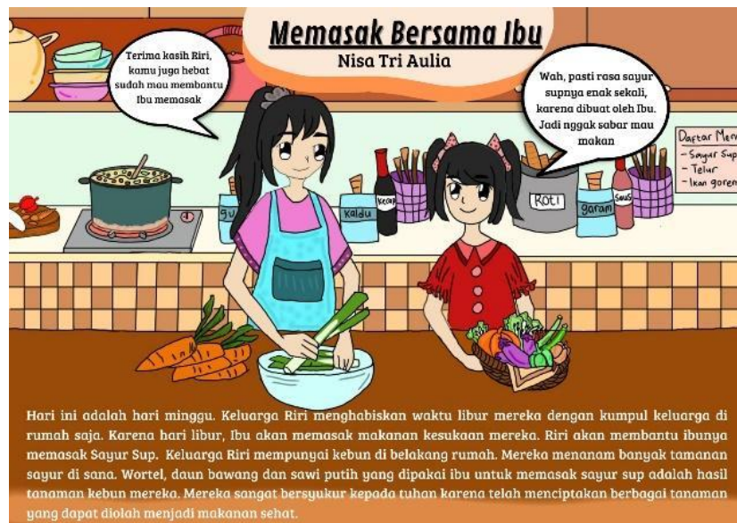
Picture 5. Theme 5: My Experience Subtheme 1: Childhood Experiences