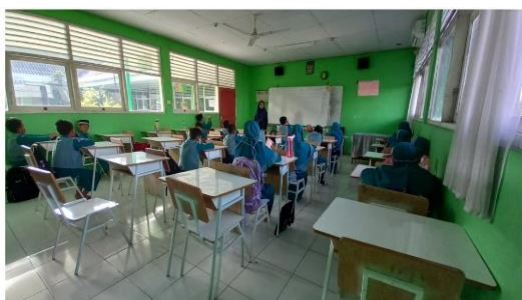
Figure 2. Learning Situation without the Discovery Learning Model

The researchers observed five times in class, but not all used the discovery learning model. For observations that did not use the discovery learning model, the researchers observed class conditions and students' ability to think critically. The researchers also saw that the VB class students were still less active in their learning since the teacher used the lecture and assignment method.