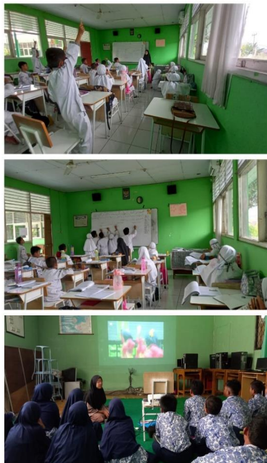
Figure 3. Learning with the Discovery Learning Model

think logically and analyze, had curiosity, and had an assessment of the problems the teacher gave. The researchers then took 4 out of 25 VB class students as samples in this study: NSD, MR, HKH, and MAA. The documentation can be seen in Figure 4 below.