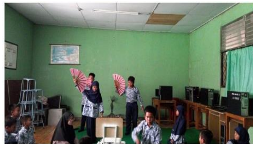
Figure 5. Students Practicing Traditional Dances Based on Group Creations

The third observation after using the discovery learning model uncovered that students could think critically, seen when students could build their mindset by finding out the causes, symptoms, and how to treat influenza, bronchitis, tonsillitis, and pneumonia and then making a chart or mind map. The researchers saw collaboration between students, such as MAA, HKH, NSD, and MR, even though they also liked to joke. They could also do individual tasks well. Students were also able to be creative by performing creative dances using props. For example, NSD was enthusiastic about representing their group in practicing the Manuk Dadali dance. Meanwhile, MAA practices the fan dance.