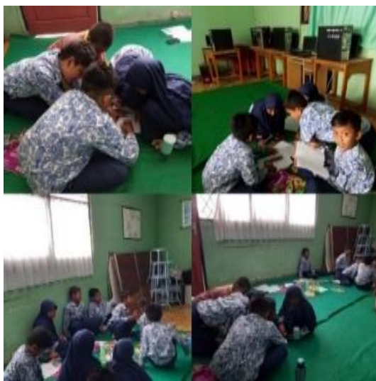
Figure 4. Student Activities Discussing with Groups

Meanwhile, NSD and MR could quite think logically with their group because they only occasionally participated in discussions. The four of them also could do individual assignments given by the teacher with quite good results. Also, they could analyze the problems given by the teacher. It could be seen when the teacher asked students to make questions and answers according to their reading text.