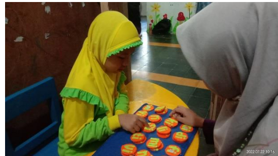
Figure 2. Introducing Early Reading to Children

experienced an increase daily. Moreover, teachers always provide parents with daily reports regarding children's school achievements.