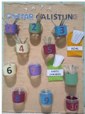
Figure 2. Mathematical Content Smartboard Media

In the application of smartboard media for reading, writing, and numeracy skills, several steps for smartboard media for reading and writing skills are as following steps.