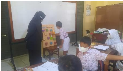
Figure 8. Taking Questions and Answer Cards