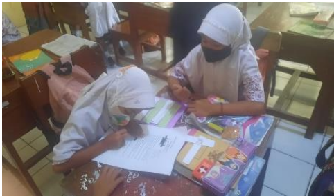
Figure 6. Determining Content and Answering Questions