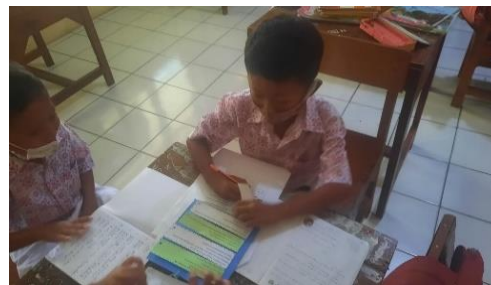
Figure 4. Reading Texts to Each Other and Composing Texts