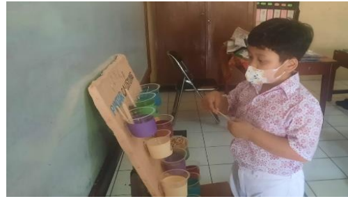
Figure 9. Solving Problems and Counting Story Problems on Smartboard Media