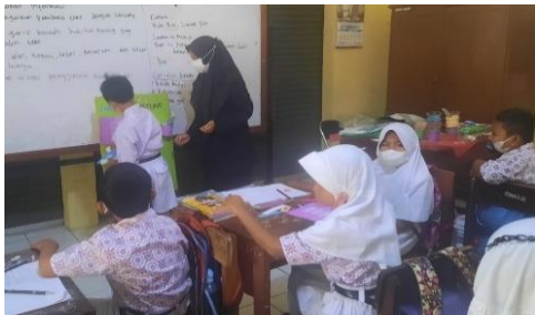
Figure 7. Presenting and Pasting Questions and Answers

In addition to reading and writing, there are also smartboard media steps for numeracy skills, including: