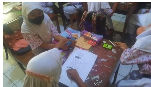
Figure 10. Writing Answers