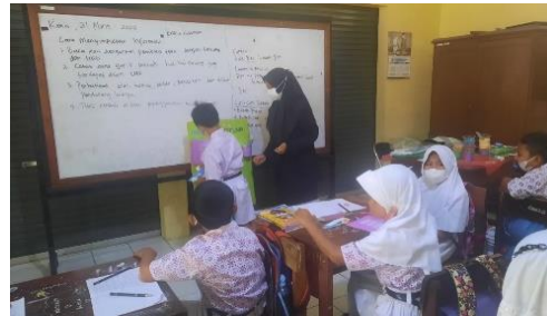
Figure 3. Taking Reading Texts, Questions, and Answer Cards