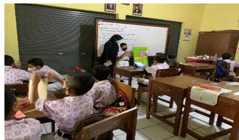
Figure 5. Reading Coherent and Correct Text