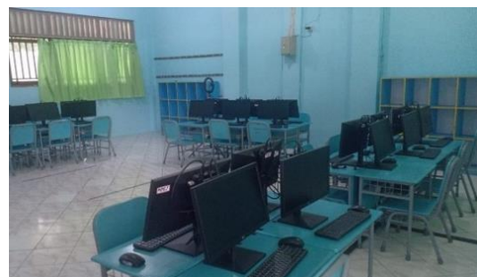
Figure 2. Classroom Layout, One Student One Computer

“The challenge I found was when we have to move to digital content. We struggled to develop the content and made several revisions until it was ready to use in daily learning activities. We learned to make videos, make quizzes, and other contents in a relatively short time. It also needed effort to help the students adapt to electronic device and digital content.” (Interview with the School’s Teacher).