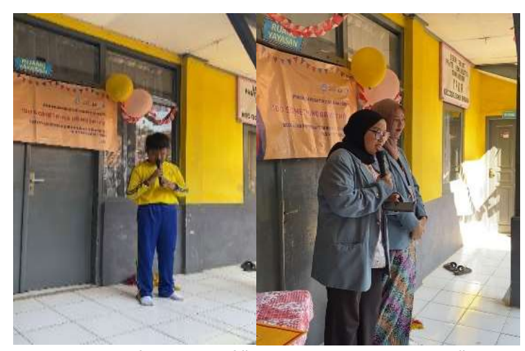
Figue 5. The performance of "Do Something or Nothing" activity