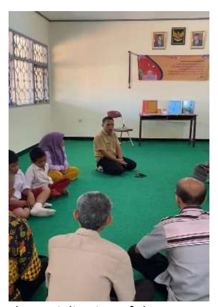
Figure 2. The socialization of the program PKM-M

The PKM-PM team worked together with the SLB A YPKR Cicalengka school to both understand the correct form and use of "Kartu Braille Bertanya" For this reason, this program needs to be socialized first to teachers and all blind students regarding the form of the "Kartu Braille Bertanya" game activity that will be implemented at school.