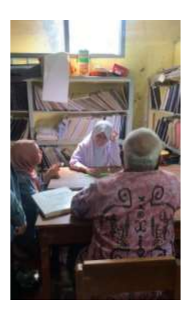
Figure 1. Introduction the program of PKM-M at SLB A YPKR Cicalengka

The observation stage was carried out in two stages. The first stage was carried out by the PKM-PM team which was carried out indirectly via the internet to search for information related to SLB A YPKR Cicalengka, then the second stage was the direct stage which was carried out by visiting the location of the target community, namely the PKM-PM SLB YPKR TEAM in Cicalengka . After carrying out initial observations, in the next stage the PKM-PM team carried out an introduction to the program that had been created to the school which was attended by the principal and also students at SLB A YPKR Cicalengka who were also one of the representatives of blind teachers through discussions.