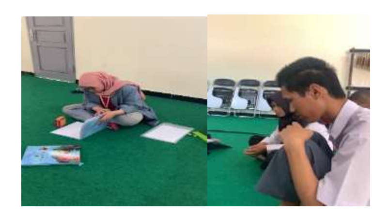
Figure 4. Mentoring activities

This mentoring activity was carried out on August 23 2023. This activity is intended to guide and train blind students to choose one of the most popular activities among all the learning while playing activities that have been carried out previously, and will later be developed into the form of work or learning outcomes, especially reading poetry, reading folklore, reading fairy tales, singing or expressing feelings to loved ones.