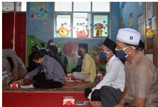
Figures 2,3,4, and 5. Community Service in Darul Hanipab Kindergarten Complied the Health Protocols

In the implementation, the participants were given an explanation regarding the importance of building a qur'anic generation and the internalization of politeness values in language use in the perspective of the Qur'an reflected in six phrases, namely: qaulan sadidan, ma'rufan, balighan, maysuran, layyinan, and kariman .