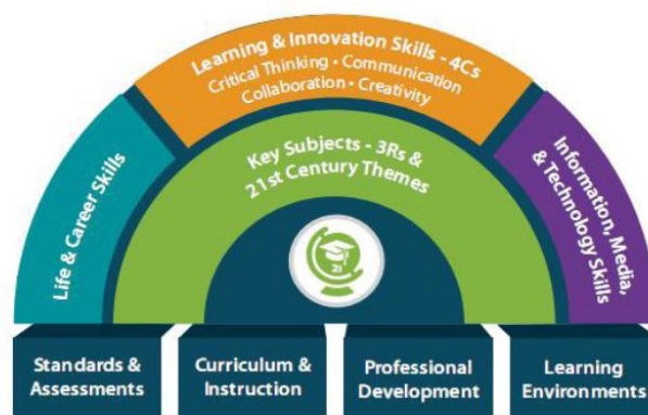
Figure 2. 21st-century Skills Rainbow Diagram

In this study, it was found that 21st-century skills do not only come from one source. The authors have identified and observed 43 skills from three documents analyzed, including P21 (12 skills), enGauge-21CS (20 skills), and AT-21CS (11 skills). Skills. Their skills also have some of the same things (Afandi et al., 2019). This is proof that the skill demands contained in the three documents have the same content, and there is a reflection of conformity between the various competency frameworks, indicating the level of agreement between researchers in the field (Afandi et al., 2019). If we identify and compare the Conceptual Framework of 21st-century skills from the three institutions are as follows: