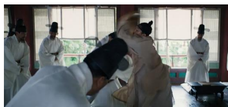
Fig. 1 - Movie Sado [사도]; PLH/ND1/01:04:55:23-01:05:23)