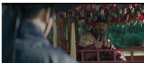
Fig. 5 - (Movie Sado [사도]; PR/Nd.1/00:48:03-00:49:34)

There are several scenes where King Yeongjo's actions led Hyojang perceived himself as a failure. On a pilgrimage to the tomb of Sukjong Daewang, King Yeongjo blamed Hyojang for the rain in the area that should have fallen on dry land. Hyojang wrote a letter to the local leader before they arrived. Hyojang mentioned in that letter that he enjoyed reading and writing poetry. Knowing that Hyojang disliked studying, the King said that Hyojang's falsehood was to blame for the rain. Therefore, he ordered Hyojang to return to the palace. King Yeonjo's attitude and order displayed that he considered Hyojang as a bearer of bad luck. He did not even want to see his son around himself. However, Hyojang, experiencing shock and distress, was unable to take any action other than obeying his father's order. Fig. 5 below presents movie Sado [사도]; PR/Nd.1/00:48:03-00:49:34.