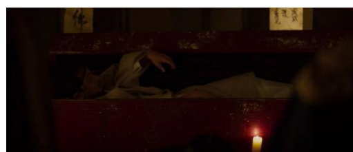
Fig. 8 - (Movie Sado [사도], 01:11:11)