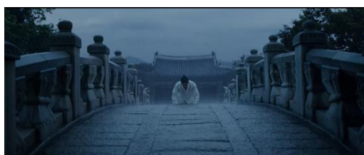
Fig. 7 - (Movie Sado [사도]; PR/Nd.3/01:33:36)

his mother was the queen, for example, bowed four times in the 60th birthday of his mother. He was then accused of killing a eunuch and cooperating with a shaman, Buddhist nun, and courtesan to kill the king when actually those people were the ones who helped him perform his defense mechanisms. It is evident that the king's aversion led him to place greater trust his courtiers, causing him to immediately believe the accusations against Hyojang as they implicated his disliked son. Moreover, the king meted out punishment to Hyojang without undertaking an investigation into the actual events or affording him an opportunity for a fair trial. Although Hyojang and the courtiers from other factions advocating for an investigation into the acquisition report, the king proceeded to impose his punishment on Hyojang. At this point, the king ceased to regard Hyojang as his son, but rather perceived him as a traitor. This event surely shocked Hyojang who was innocent. Hyojang then felt betrayed by his own father who preferred to listen to the other faction. He felt powerless, sorrowful, unlucky, despised, and deeply hurt. Despite all the terrible feelings he experienced, he still did the punishment from his father obediently. Fig. 7 below shows movie Sado [사도]; PR/Nd.3/01:33:36.