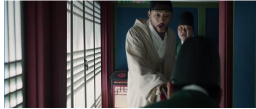
Fig. 2 - (Movie Sado [사도]; PLH/ND2/01:13:40)

palace for that because preparing the prince's clothes was one of the head of the palace's duties. He might think that the head of the palace put him in the situation where he would be punished by his father or make his father disappoint again. Therefore, the head of the palace became the substitute target in this part because he was the one who prepared and managed Hyojang's attire. Fig. 2 below presents movie Sado [사도]; PLH/ND2/01:13:40.