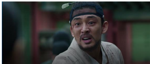
Fig. 3 - (Movie Sado [사도]; PLH/ND3/01:14:23-01:14:51)

(3) Venting his anger and threatening to kill everyone in front of his mother, wife, son, and sister, which was motivated by Hyojang's anger over his inability to coexist with his father. This scene showed how deep Hyojang's desperation was until he could not control his anger and vented it on his beloved people. His ambition to fulfill the role of a perfect son and crown prince for his father obscured his judgment, causing him to overlook his responsibility as a son, husband, father, and brother. He displaced his target to his family. This scene proved that his father plays the most significant role in contributing to his psychological issues. Fig. 3 below presents movie Sado [사도]; PLH/ND3/01:14:23-01:14:51 and Fig. 4 shows movie Sado [사도]; PLH/ND3/01:14:21-01:06:07.