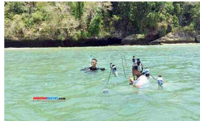
Picture 7. The submerging process of the Coral Demonstration Plot

tourists are invited to buy tour packages. Then, this tour package is also good for sustainable underwater ecosystems in Pangandaran, especially in the Pananjung Nature Reserve area. In this case, it is also necessary to monitor evaluations with periodically by partnering with communities in Pangandaran, so that the efforts to conserve coral reefs are sustainable.