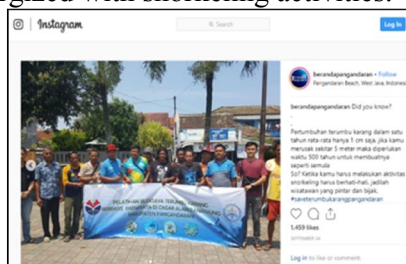
Picture 6. Post-Training Documentation of Coral Reef Cultivation

Before being applied directly to tourists, the implementation of coral reef cultivation efforts is carried out in several forms and several stages. The first was carried out with Coral Reef Cultivation Training activities with the aim of being Pangandaran people organized as KMPP (Pangandaran Community Care Community), OP3 (Pangandaran Cruise Boat Organization), and watersport operators in the form of Focus Group Discussion. After the socialization to identify constraints in the cultivation of coral reefs in Pangandaran, a solution was obtained from the discussion which was then poured into a follow-up program which was focused on the search for coral seedlings as shoots for Coral Gardening and fostering the Making of Tourism and Education Conservation Packages (Coral Gardening) which is synergized with snorkeling activities.