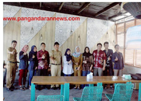
Picture 3. Management of Resort and Leisure UPI Bandung Field Project Study

Pesiar Pangandaran) and Water Sport Operators to facilitate the team in carrying out and achieving the objectives of the activity.