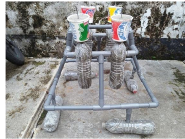
Picture 5. Coral Demonstration Plot Design

The output of this service activity is, among others, the Demonstration Coral Plot (demplot coral). Demonstration plots are a method of restoring coral seedlings, to be able to become coral reefs. The following are the construction materials from the demonstration plot such as Pipe, empty Mineral Bottle 1000ml. Instantly packaged cup noodles, Cement, and last is the Iron Wire.