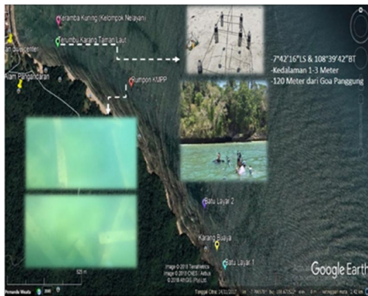
Picture 4. Coral Reef Spot Distribution Map and Demonstration Plot Sink

Then the water point was found in the Marine Park Coral Reef area for the first attempt to sink the demonstration plot by the team, where it also became a snorkeling spot that was usually served to tourists on the East Coast. The sinking point of the demonstration plot is at a depth of approximately 2-3 meters and is located at 120 meters from the Goa Panggung tourist attraction point, more precisely at the coordinates of 7^{\circ} 42'16'' LS & 108^{\circ} 39'42'' BT.