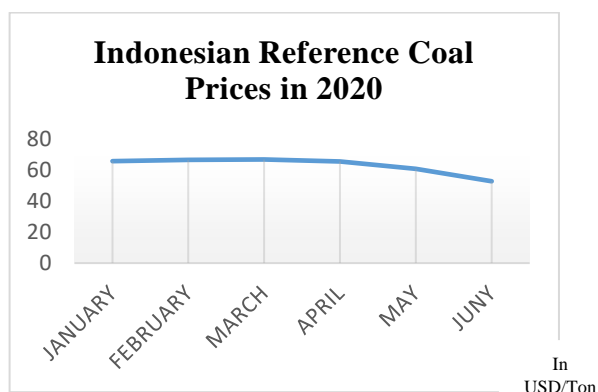
Figure 1. Development of Indonesian Reference Coal Prices (HBA) in Coal Mining Companies in 2020 Source : (Ningsih, n.d.)

The first impact that was felt due to the outbreak for the coal mining industry was the decline in Reference Coal Prices throughout 2020. This may be due to limited export and import activities as well as constraints in carrying out company operations, the following is the graph data: