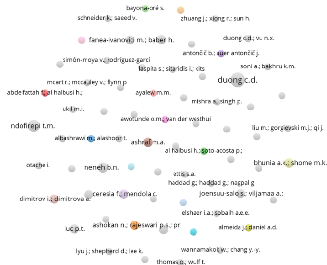
Figure 4 shows that there is a lot of research from various universities in the world that often research and publish about entrepreneurship.