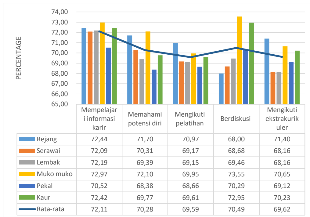
Gambar 2. Tingkat Kesiapan Perencanaan Karir Siswa SMK