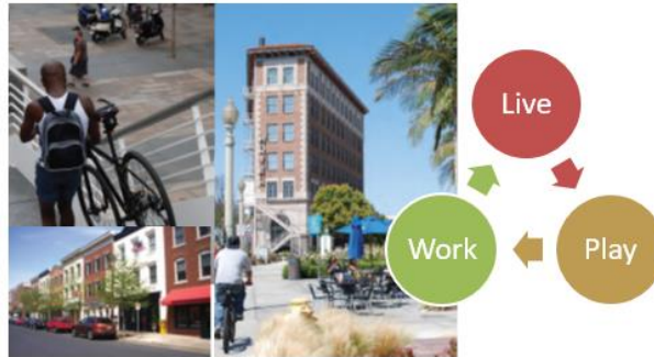
Image 3. Live Concept, work and Play in One Place

The expectation of less mobility is that in a smart city, residents of a city do not need to make a move that takes long distances to reach their desired destination. Even in a smart city, it is also possible for residents to move close to 0 km to do something and fulfill their needs. From this statement we can also conclude it as a concept of live, work, and play in one place, in the sense that all activities we do are centered on only one place so that the commuting trip of the average person per day will be reduced. The following is an overview of the expected less mobility.