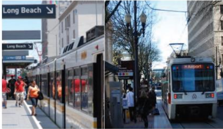
Image 6. Express train and Commuter

With a picture that in the future it will create a transportation condition that has an elegant element in its movement, and can provide comfort and effectiveness in the operation of the train. This transportation condition is an ideal transportation condition that is expected by every city in the world.