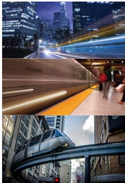
Image 7. Expectation of Less Travel Time Transportation

With a picture that in the future it will create a transportation condition that has an elegant element in its movement, and can provide comfort and effectiveness in the operation of the train. This transportation condition is an ideal transportation condition that is expected by every city in the world.