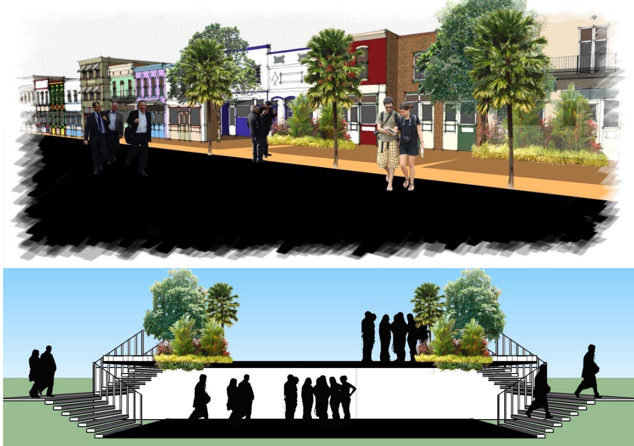
Image 5. Illustration of Move Freely (above) and downway for pedestrian (below)

about congestion, traffic congestion and road improvement. In a smart city, these obstacles are something that must be minimized in the movement process, because an obstacle will have an impact on the limitations of travel choices and the time to destination. One hope in reducing barriers by taking an example in the case of pedestrians, in this case pedestrians are given a special path that makes them feel safe and comfortable to walk in any condition, here is an overview of move freely.