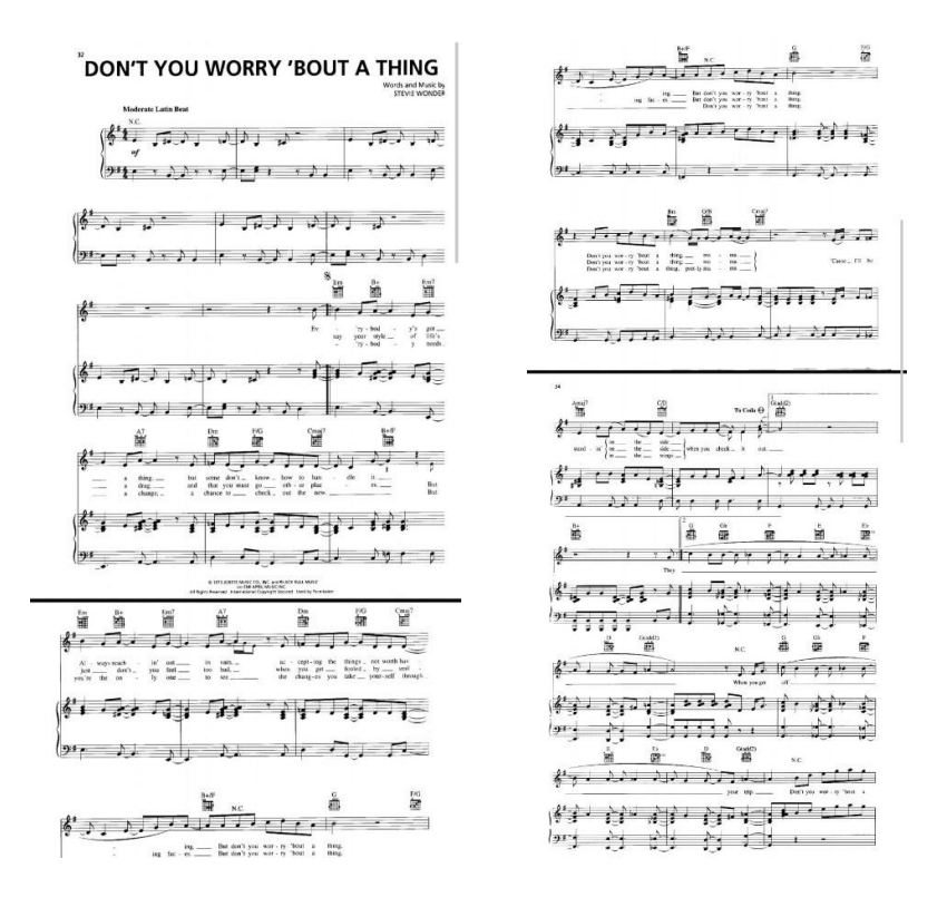
Figure 1. Repertoire Don't You Worry 'Bout A Thing by Stevie Wonder

Rhythm, particularly in a composition such as "Don't You Worry 'Bout A Thing," showcases syncopated rhythms and a Latin-inspired beat. Improvisers can modify rhythm by changing the positioning of notes, incorporating syncopation, or experimenting with rhythmic subdivisions. One possible approach is manipulating phrases by stretching or compressing them, utilizing triplets, or exploring polyrhythms. In addition, a vocalist may employ scat singing, utilizing syllables and vocal sounds to imitate instrumental rhythms and enhance the performance with greater dynamism and engagement. By altering the rhythm, a vocalist can sustain the audience's attention and inject spontaneity and exhilaration into the improvisation.