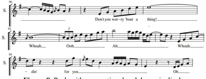
Figure 8. Peak with an emotional and dynamic display

g. Tori Kelly skillfully combines all these components at the song's end, resulting in a compelling and heartfelt conclusion. She modifies the melody by incorporating her distinctive embellishments and highlights the intensity of feeling and the changes in loudness, singing at a high decibel level that demands notice. Employing the Mix Chest Voice and Riff n Run techniques, she presents a concluding performance that is technically remarkable and profoundly touching. The breadth of emotions she can express, and her unwavering technical accuracy is a testament to her artistic prowess and vocal aptitude.