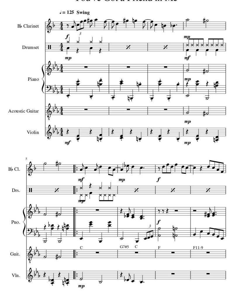
Figure 1. Intro part of "You've Got a Friend in Me"

At bar 14, the Bb Clarinet and Violin assume the role of a counter-melody to the main vocal melody. They do so by utilizing distinct registers and textures, which contribute to a rich and layered quality in the vocal melody. Subsequently, the addition of drum percussion adheres to a consistent rhythmic pattern, resulting in a more compact and enriched beat throughout all the instruments. A counter-melody is a series of notes that form a melody and are intended to be played at the same time as a more prominent main melody. Put simply, it refers to a supplementary melody that is played in contrast to the primary melody.