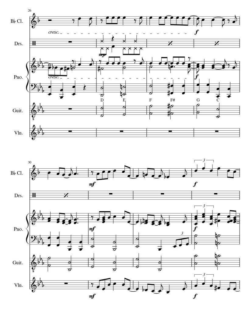
Figure 3. Homophonic texture of Bb Clarinet and Violin instruments in bar 30

An intriguing aspect of the chord progression in this Theme Song is that "You've Got a Friend in Me" is composed in the key of Eb Major. It is due to the prevalence of major chords, as well as minor chords, in popular music. The three primary chords, constructed from the first, fourth, and fifth scale degrees, are all major chords (Eb Major, Ab Major, and Bb Major). The theme song is composed in the Key of Eb Major. The intro section features a series of chords, as depicted in the image below.