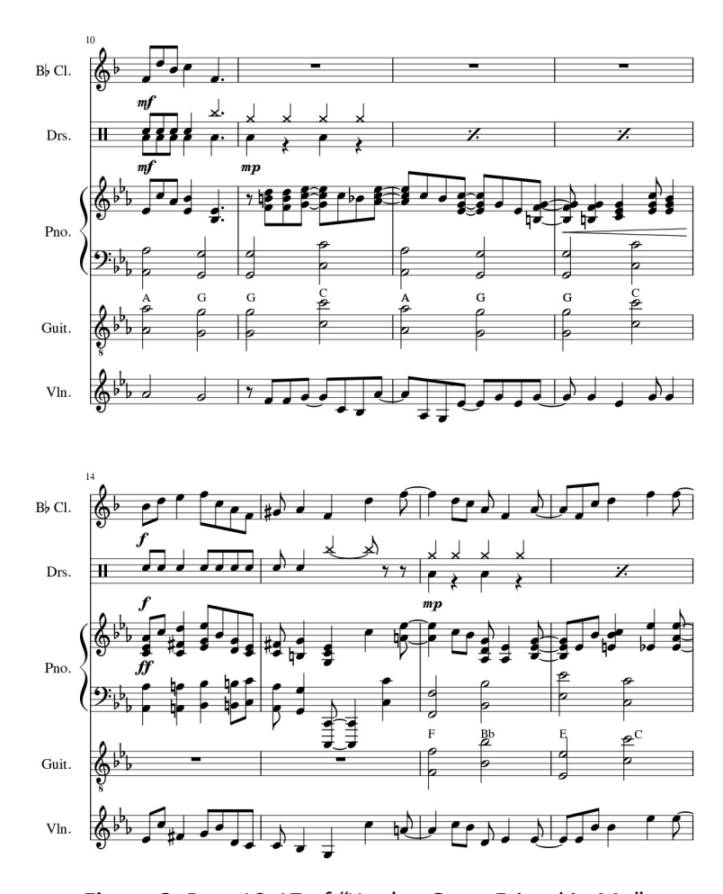
Figure 2. Bars 10-17 of "You've Got a Friend in Me"

In bar 30, a recurring pattern emerges when the Bb Clarinet and Violin instruments exhibit a homophonic texture. This texture is characterized by the same rhythm and movement across one or more parts. Homophonic texture is a musical genre characterized by many sounds being performed concurrently, resulting in an intriguing composition.