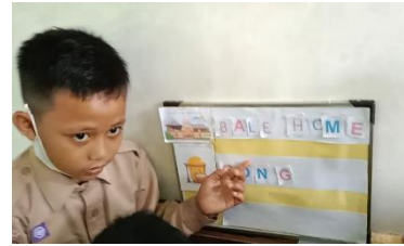
Figure 4 Application of Word Board and Picture Card Media