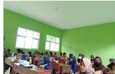
Figure 5 Researchers Reflection