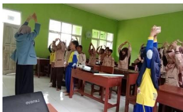
Figure 3 Ice-Breaking “Dancing Marina”