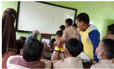
Figure 1 Presentation of Introduction to National Culture

After the second stage is completed, the next activity is closing. In this activity, the researchers carried out reflections in the form of questions about the understanding gained from the material being taught, the interest in the media used, and the level of satisfaction with the activities during the learning process. Next, the researcher gave thanks, impressions, messages, and motivation to class IV students at SDIT Cahaya Permata who were enthusiastic about participating in English learning.