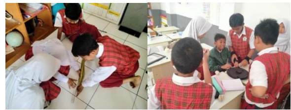
Figure 2 Measuring technique of rope folding and the use of tapes

progress or development so that the measurement results were more precise with a faster and more efficient process.