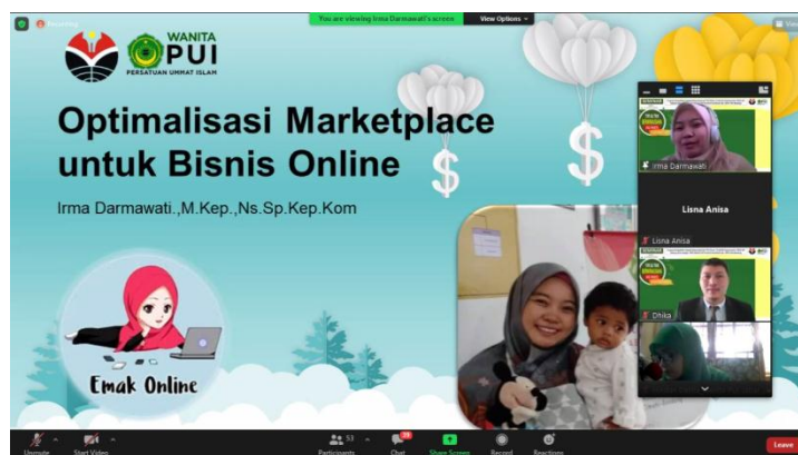
Figure 2. Video Conference on marketplace optimization for online business

The second material presented in this community service is related to optimizing the marketplace for online businesses for women. Nowadays, the rise of the marketplace must be seen as an opportunity for aspiring female entrepreneurs. Outstanding capabilities and proficiencies of women entrepreneurs include an innovative and creative orientation, leadership qualities and self and social awareness, the ability to identify opportunities, the ability to take risks, and the ability to commercialize resources through the production of goods and services to meet the current market needs.