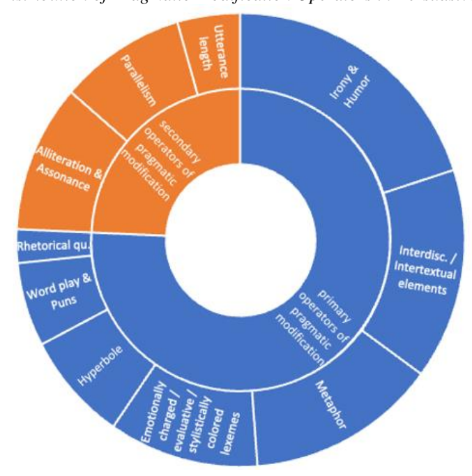
Figure 2 Distribution of Pragmatic Modification Operators in Persuasive English Mass Media

In The Atlantic's "The End of Trust" the author employs secondary syntactical operators of pragmatic modification to charge the functional space of the opening fragment with persuasion and evaluative semantic components: