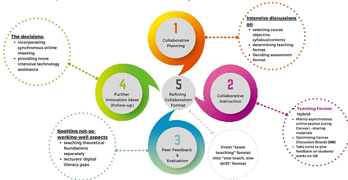
The JPD Model of Lecturers' Online Collaborative Teaching

Lecturers found composing course syllabus formidable when it came to selecting which contents from each course that could be merged. They had to ensure the selected topics would complement one another. In this instance, both instructors should pool their knowledge to establish a consensus on how teaching and learning will take place (Sileo, 2011; Tannock, 2009). They discussed and figured out that practical topics tended to be more flexible to be integrated, compared to the theoretical ones. In addition, co-lecturers further concerned about whether or not a topic/content can be taught effectively online. Due to the fact that face-to-face learning materials cannot easily be transferred to an online setting (Kebritchi et al., 2017), adjusting existing classroom-based contents and generating new ones for online instruction can be laborious Li & Irby (2008). Acknowledging this, lecturers agreed to place the theoretical topics of each course in the second through seventh meetings. Delivering merged topics, on the other hand, would be in the following meetings.