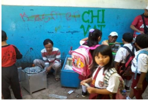
Figure 14. Authentic but not officially-endorsed food vending outside the school building