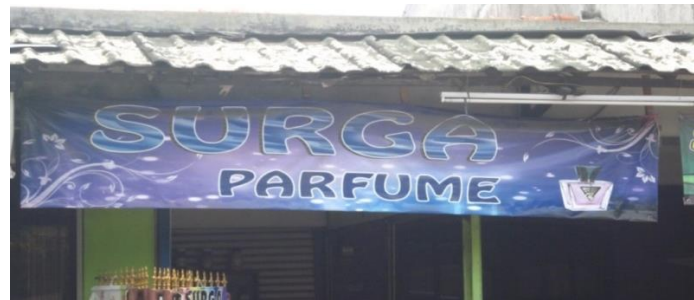
Figure 16. A perfume advertising banner

suggested in this linguistic landscape snapshot study. The findings show that the linguistic landscapes around schools have many texts related to food, nutrition and health campaigns (89%), yet also some cigarette and other products advertising (11%). The various languages convey messages for different purposes. Indonesian as the main language used is the language of curriculum delivery, Arabic relates to the religious preparation of food, Sundanese, Japanese and English relate to other aspects of food, health, nutrition and life.