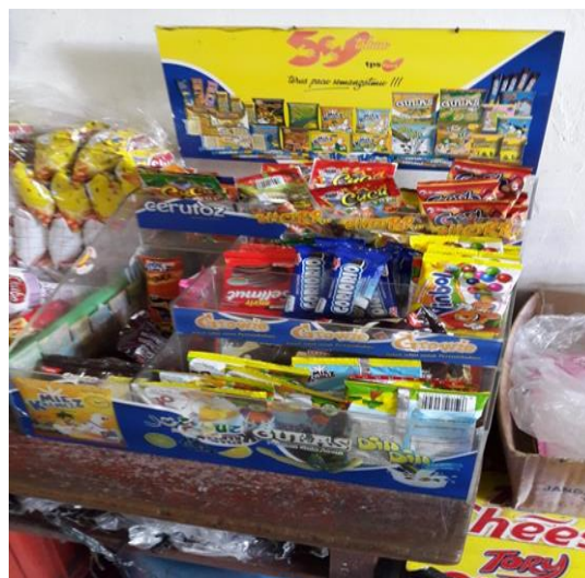
Figure 7: a range of snack foods displayed for sale at a school canteen.

Figure 8 is an example of a health campaign in a schoolscape. It also shows a Tupperware (a plastic food container multinational company) advertisement, which contains an educational message. This kind of health campaign from various health and food products is written in Indonesian.