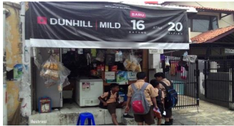
Figure 15. A cigarette advertising banner

Figure 16 does not advertise “unhealthy” products, but it is an advertisement, just the same. It advertises Surga (Heaven) Perfume, and it was found on an advertising awning outside a shop opposite a school. There are many images of this kind around school buildings in both cities.