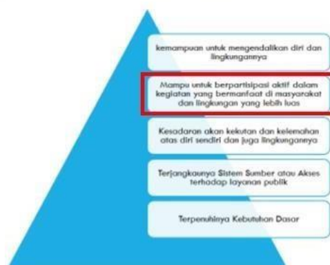
Figure 3 Results of the analysis of the level of community empowerment

In contrast to Veneklasen in (Firmansyah,2012) divide the level of empowerment into four parts. Community empowerment presents indicators of the level of community empowerment as a direct or indirect result of community empowerment programs (Firmansyah, 2012). The four parameters of the level of community empowerment are explained as follows: