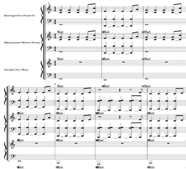
Figure 3. score notasi 3

High and low sound in tone is no less important is the length and shortness of the tone which is very related to time. Thus, each note is given a symbol to distinguish notes that are worth a whole, half, quarter, and so on. The basic tone formed in the music of the minoris is C=DO and followed by the composition of the pitch shift to Bminor and G#minor. In the form of harmony, the composition of the tone is formed as follows which is the complete notation of Minoris Music made in the application / (DAW) Studio one: