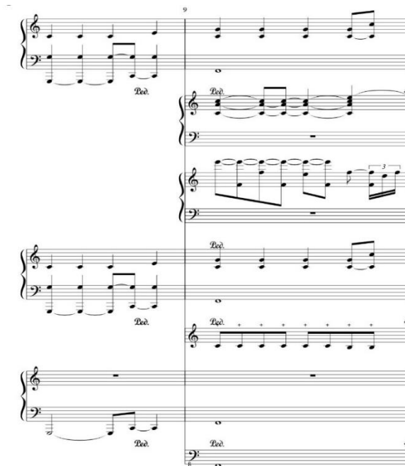
Figure 4. Score Notasi 4

In relation to Minoris Music as an accompaniment to narcotics videos in the analysis of its musical form using weight scale theory, it creates emotions of calm and stability in its application. In the analysis that has been done, the author identifies that Minoris Music is Music that can bring an emotional atmosphere to the audience in accompanying the KEJATI KEPRI public service advertisement narcotics video.