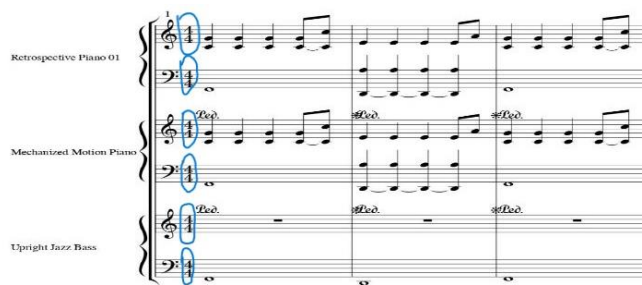
Figure 1. Score notasi 1

several key components (Leonard B. Meyer, 1957).