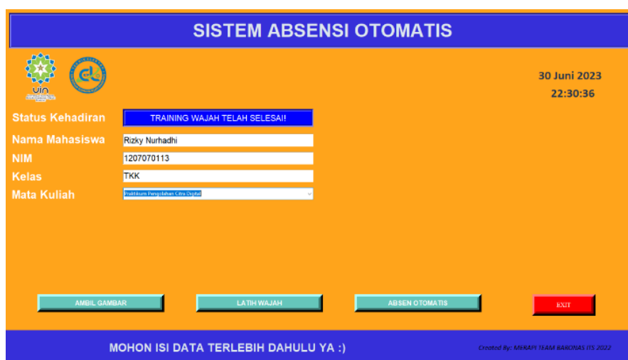
Figure 5. Completed Training Process

Data in the form of photos of student faces after the "Take Picture" stage will be stored in several photos to become a dataset. During the registration stage, there is a training stage after taking photos of student faces for system training to recognize and identify student faces. The training stage takes a dataset that has been stored so that it can recognize faces and detect when attendance is carried out next. The training stage can be seen in Figure 5 below.