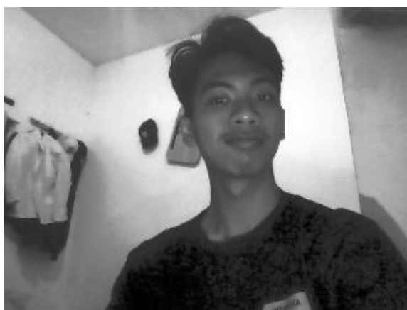
Figure 1. Dataset After Histogram Equalization

Image Preprocessing is used in the system through Histogram Equalization (HE) and Median Blur Filter methods. Image processing in the form of Histogram Equalization and median blur filter is done before the face recognition process. In image processing, Histogram Equalization helps improve the contrast of facial images by flattening the pixel intensity distribution and overcoming uneven lighting problems (Peter Pangestu, 2017). In addition, the median blur filter is used to reduce noise, smooth the face image before recognition, and remove distractions that may affect the recognition process (Wlyono, 2010). Image preprocessing is applied to facial photographs that have been stored in datasets before. The following examples of datasets that have been pre-processed are contained in Figure 1 and Figure 2.