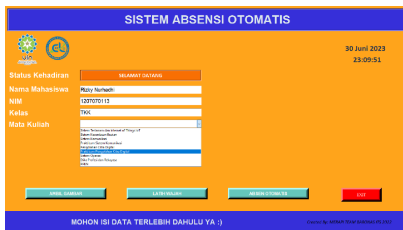
Figure 3. User Interface Display

After the program is run, the user interface appears as a display for interaction and data input for system users. The user interface section contains empty data columns of Name, NIM, Class, and Course, which must be filled in as student data during registration and attendance activities. Registration is carried out at the earliest stage as a student data registration so that the system stores data and can recognize the faces of registered students. The following displays the user interface design listed in Figure 3.