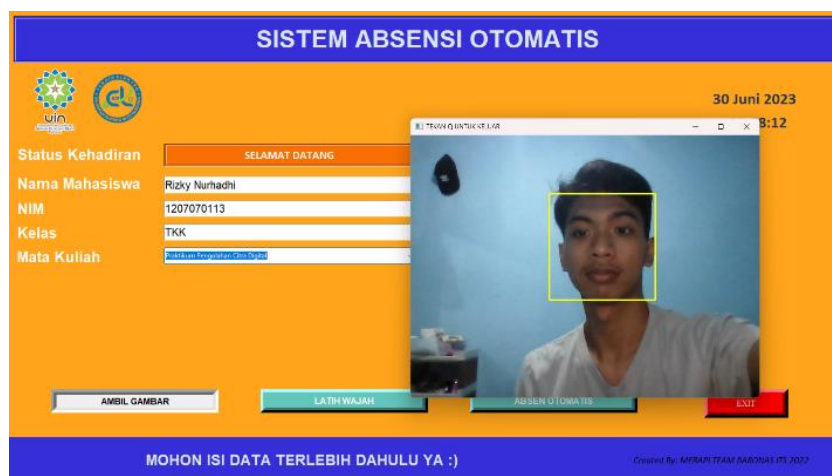
Figure 4. Image-taking process

Data in the form of photos of student faces after the "Take Picture" stage will be stored in several photos to become a dataset. During the registration stage, there is a training stage after taking photos of student faces for system training to recognize and identify student faces. The training stage takes a dataset that has been stored so that it can recognize faces and detect when attendance is carried out next. The training stage can be seen in Figure 5 below.