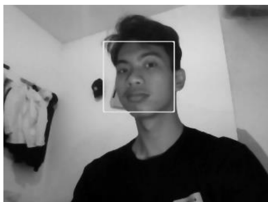
Figure 2. Dataset After Median Blur Filter