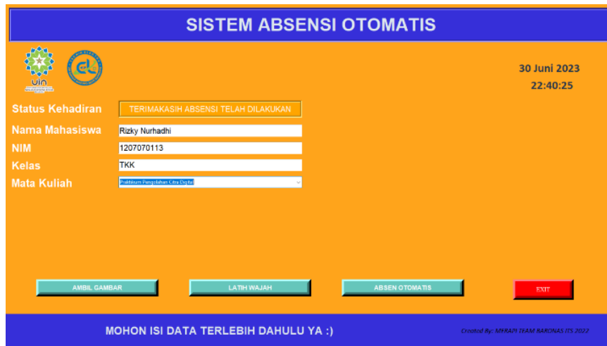
Figure 8. Presence Process Completed

The system records student attendance data from a series of attendance processes and stores it as a CSV document. The CSV document is in the form of student attendance information data in the form of a table containing Name, NIM, Class, Course, Date, and Hours when students make attendance. The form of the CSV document can be seen in Figure 2. 6 below.