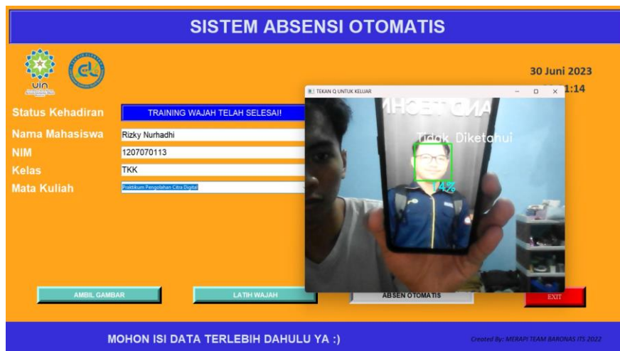
Figure 7. Systems Do Not Recognize Faces

If the user takes attendance using someone else's data or the face recorded is not the same as the data at the time of registration, the system cannot recognize the face by displaying a low accuracy rate, and there is an "unknown" notification on top of the square around the face as in Figure 7 below.