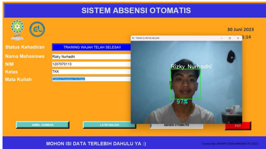
Figure 6. Face Recognition Accuracy Level

If the user takes attendance using someone else's data or the face recorded is not the same as the data at the time of registration, the system cannot recognize the face by displaying a low accuracy rate, and there is an "unknown" notification on top of the square around the face as in Figure 7 below.