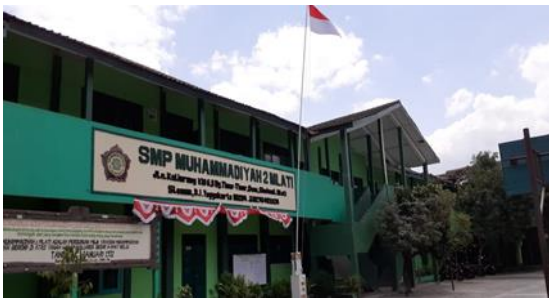
Image 1. The Environment of SMP Muhammadiyah 2 Mlati

Based on the picture above, it can be seen that the environment of SMP Muhammadiyah 2 Mlati has started to be greened and structured. With a yard that is wide enough, we can look that there is a little scattered garbage. The picture was taken while the lesson is in progress and it appears that all students were sitting orderly in the classroom.