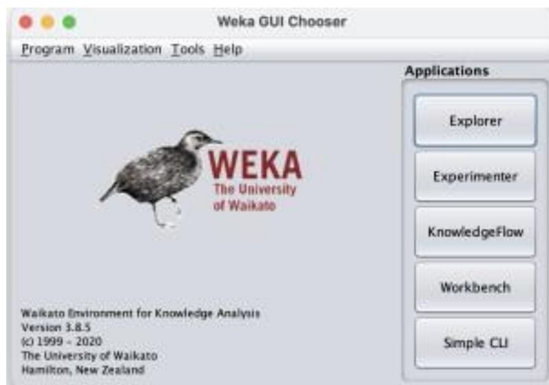
Figure 1. Weka Application startup screen weka

Machine Learning is used to learn the pattern and generate a classification model. In pattern recognition applications, neural networks are a standard Machine Learning method, and their performance has been proven. Neural Networks were employed in some pattern recognition studies. Some research about pattern recognition application in Medical filed use the Neural Network approach[16][17]. The machine learning process with neural network is depicted in Figure 2.