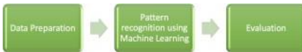
Figure 2. The flow of machine learning process

Testing Data Testing which totaled 25 data and Data Training 75 samples of early childhood data.