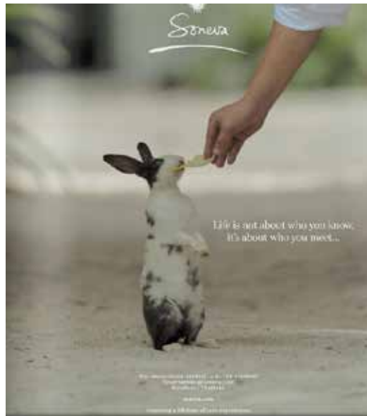
Figure 3: Soneva advertisement

(4) Life is not about who you know, it's about who you meet