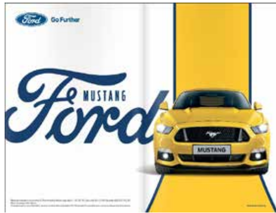
Figure 6: Mustang Ford Advertisement