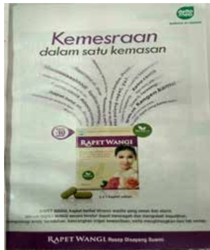
Figure 2: Rapet Wangi Advertisement