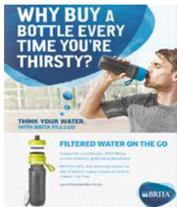
Figure 10: BRITA advertisement