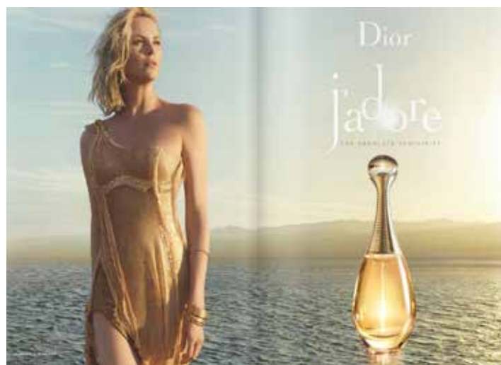
Figure 4: Dior J'adore Advertisement