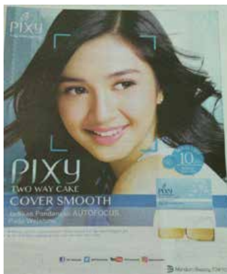
Figure 8: Pixy Two Way Cake Cover Smooth Advertisement

(9) Jadikan pandangan autofocus pada wajahmu