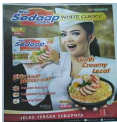
Figure 5: Mie Sedaap Advertisement