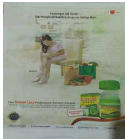
Figure 7: Balsem Lang Advertisement