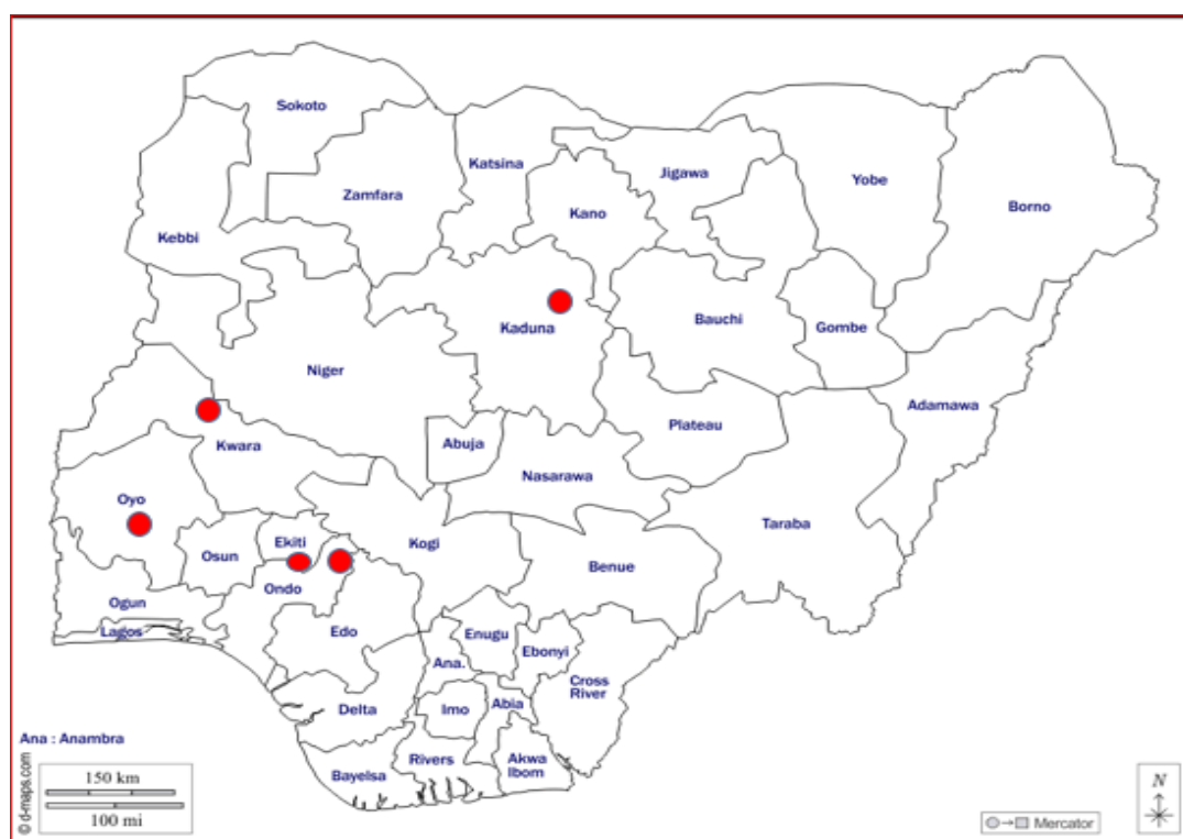
Figure 1. The Map of Locations of the used in this study.

In this study, we monitored AQI, pollutants (PM 2.5 , PM 10 , CO, NO 2 , NO, and SO 2 ), and meteorological parameters with a high temporal resolution for Nigeria, which was obtained from the Air Quality Monitoring Network of eWeather HDF app from 17 October 2021 to 31 October 2021 (see Figure 1 ). The weather app and widget provide accurate hourly and 10-day weather forecasts from two weather providers. The weather report from the weather forecast includes temperature, humidity, rainfall and new snowfall amount, wind speed, and dew points graphs. eWeather HDF app collects location data to display the current weather for the current location in the status bar and widgets, even when the app is closed or not in use. All app information is also available with various weather widgets and status bar notifications. All measurements were taken in triplicate and statistically analyzed in Excel 2013.