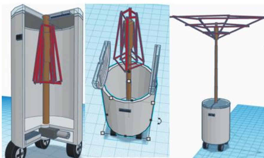
Figure 3. Show work simulation in the form of 3d model.