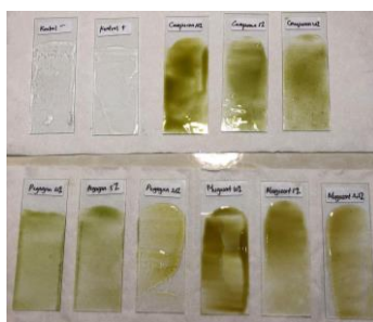
Figure 1. Homogeneity test on each gel preparation.

The diameter of the inhibition zone was measured after the agar medium was incubated for 30-48 hours using a ruler and can be seen in Figure 3 . The measured zone is the diameter of the clear zone around the paper disc, measurements are made from various sides of the circle which are then averaged. The results of the inhibition test of mugwort and gotu kola leaf extracts can be seen in Table 3 . In this study, clindamycin was used as a positive control which served as a comparison in determining the ability of the extract to inhibit bacteria. Clindamycin is an antimicrobial that is both bacteriostatic and bactericidal and has a mechanism to kill bacteria by preventing protein synthesis from bacteria (Putra et al. , 2017). The inhibition zones in the gel mixture and 1% of clindamycin in P. acnes , S. epidermidis , and S. aureus were 19.0 \pm 0.17 , 20.0 \pm 0.40 , and 25.0 \pm 0.73 , respectively, which is shown in Table 3 .