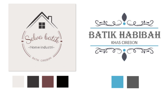
Figure 3. 2<sup>nd</sup> prototype Logo Brand

One of the strengthening activities carried out in this activity is to facilitate participants to make presentations and end with an active discussion as a means of exchanging ideas. This exchange of ideas is to improve the results of the brainstorming that has been carried out to create various ideas and solutions to problems that arise (Hisrich et al, 2008). The result of this strengthening is the development of the earlier brand logo to become the second prototype. The second prototype can be seen in figure 3.